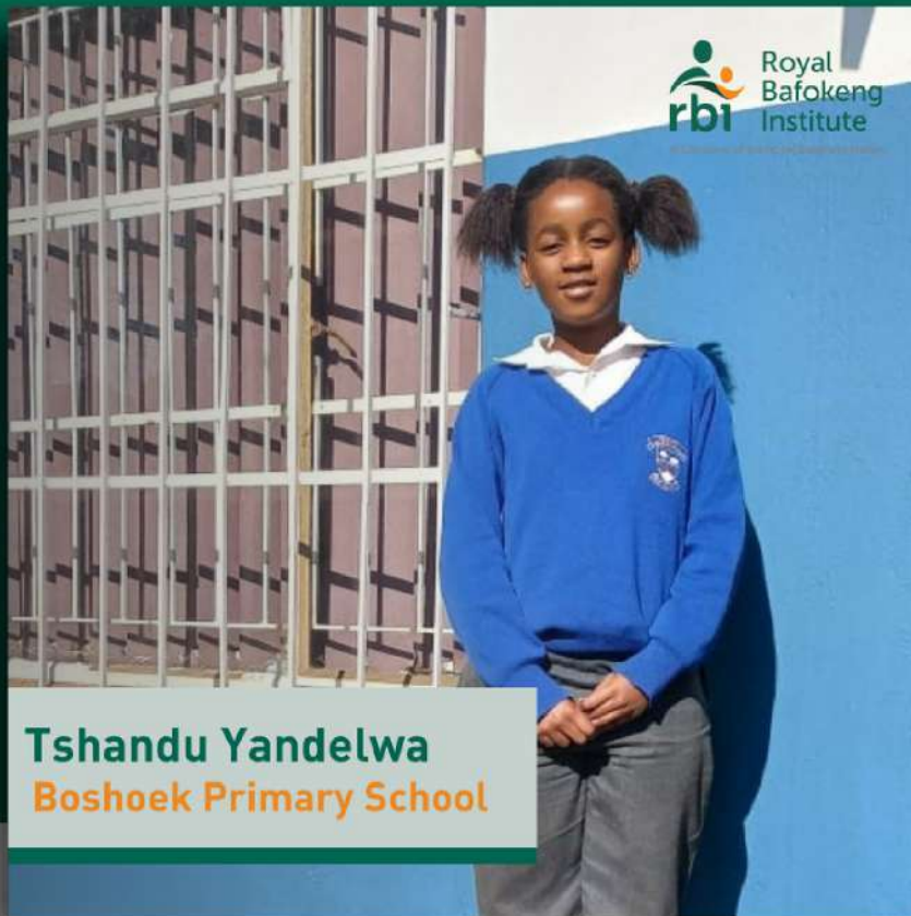
Tshandu Yandelwa Boshoek Primary School