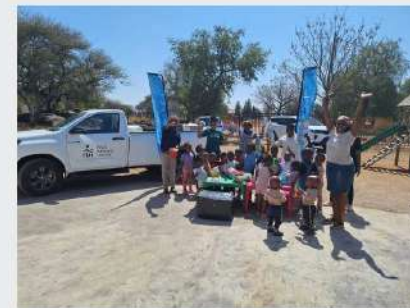
Mphepele ELC Lesung