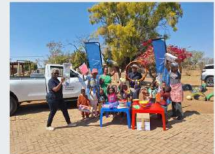
Lwaleng ELC Tlaseng