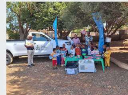
Elkiddos Day Care Bobuampya