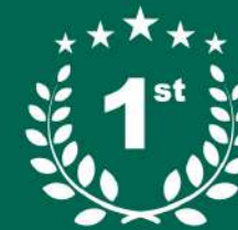
Luka Primary School (73,3%)