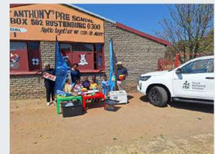
St Anthony ELC Kanana