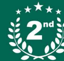
Bonwakgogo Primary School (62,8%)