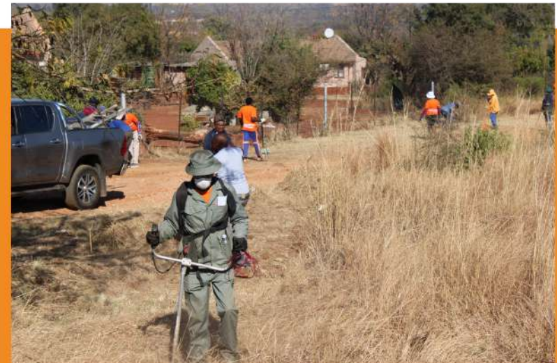
Photo 3: Cleaning included clearing grass and long vegetation in spots identified as being prone to petty crime.