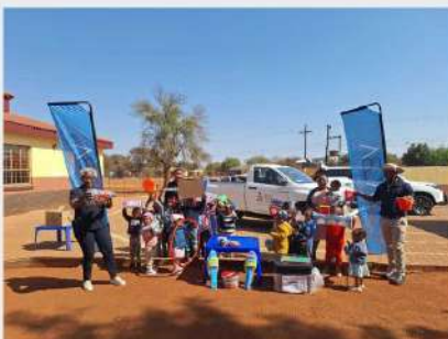
Leragane ELC Luka Village