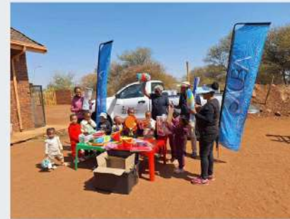
Mmakgopola ELC Maile

The partnership with BAUBA benefits different centres annually.